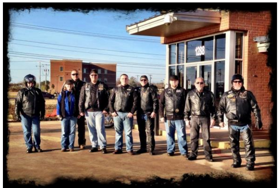
“Wreaths Across America” riders