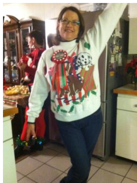
First place baby!