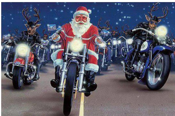
Hope you were on “the naughty” list