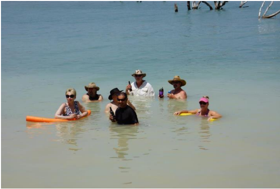
Come on in the waters fine!

If you missed the beach party you definitely missed out