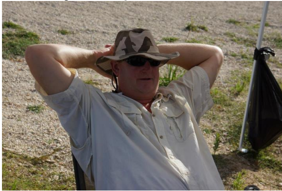
Just keep listening honey.