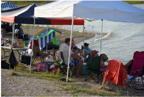
Or just stay in the shade