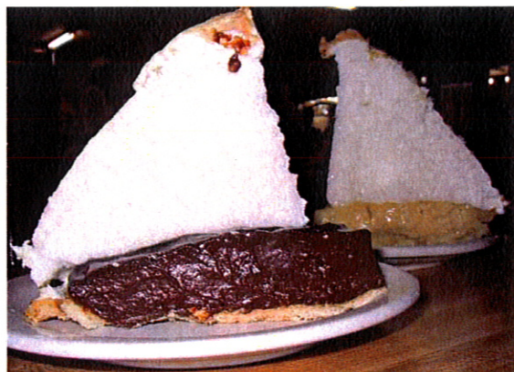
"Foreground: chocolate meringue; background: coconut cream. The best bowling alley pies we've ever found!" - Michael Stern